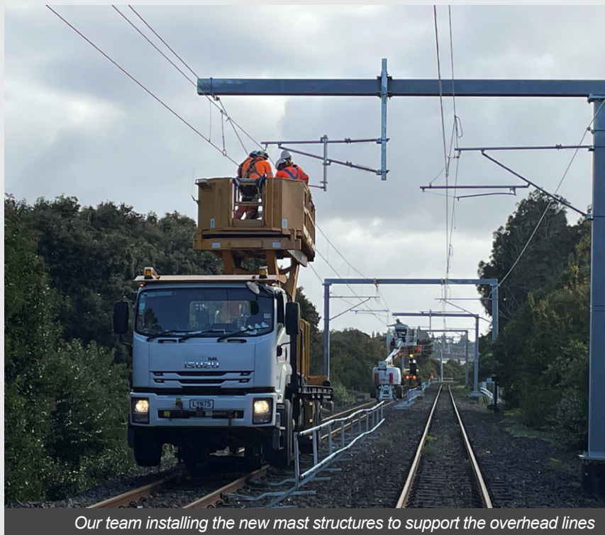
Our team installing the new mast structures to support the overhead lines

Our team have been working on installing the mast structures that support the overhead lines since last year. It is expected that they will all be in place by late October this year.