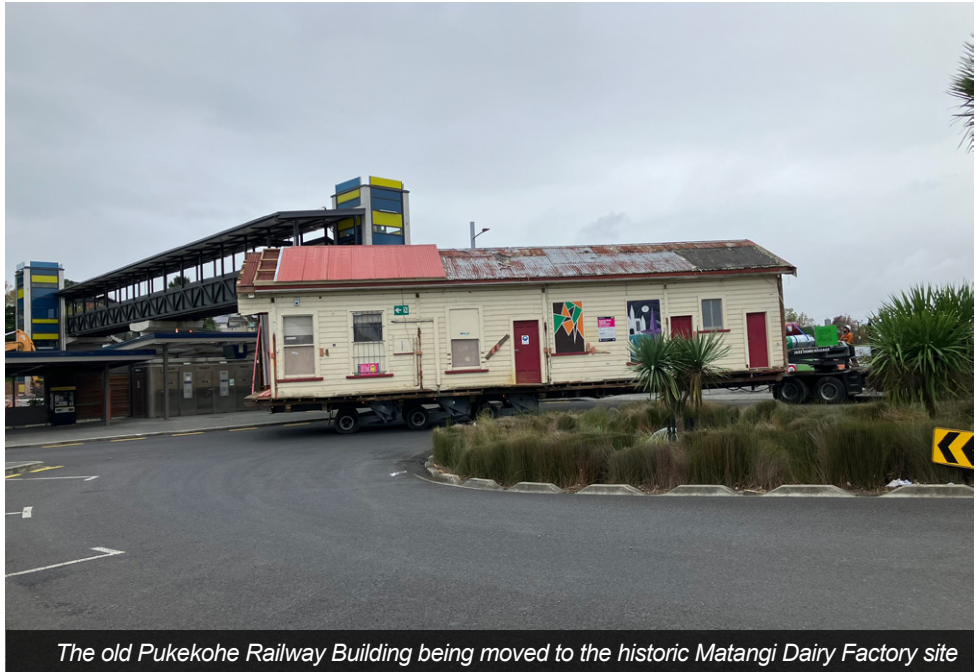
The old Pukekohe Railway Building being moved to the historic Matangi Dairy Factory site

The P2P electrification, together with plans to build three new stations between Papakura and Pukekohe, means the growing population of Southern Auckland will enjoy improved access to rail as well as faster, cleaner and quieter electric train journeys.