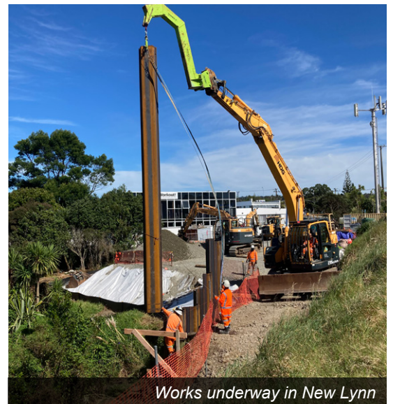
Works underway in New Lynn

For any queries, email us at contactus@kiwirail.co.nz