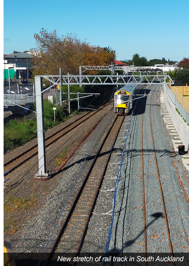
New stretch of rail track in South Auckland

The Third Main project comprises a third new rail track between Westfield and Wiri junctions as well as major improvements at Quay Park where rail connects with the Ports of Auckland in downtown Auckland. The project is expected to be completed in 2024.