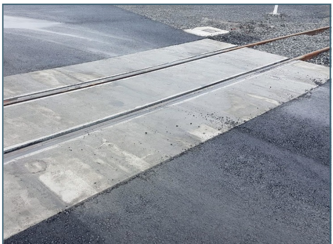
A 'CONCRETE (EDILON) SLAB' LEVEL CROSSING consists of concrete slab with inserted railway lines over the vehicle crossing. Concrete slab level crossings require minimal maintenance and can last a long time before needing to be reviewed. Concrete slab level crossings are ideal for level crossings with high vehicle usage, particularly by heavy-axle vehicles, and are suited to commercial and industrial type properties.