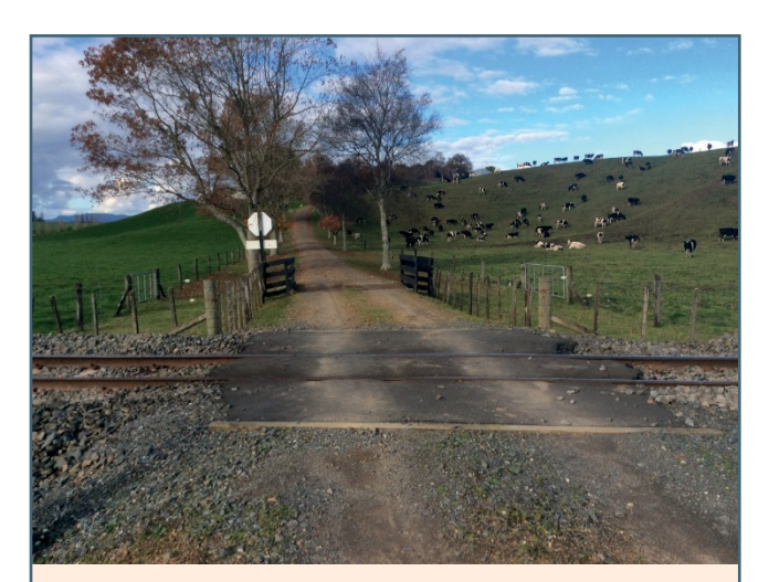
AN 'ASPHALT' LEVEL CROSSING consists of a base being prepared and asphalt laid over the level crossing to around 1.5 metres from the railway centre line. Asphalt level crossings require minimal maintenance and can last a long time before needing to be renewed depending on usage and topography of the land. Asphalt level crossings are also ideal for residential, lifestyle and some rural properties.