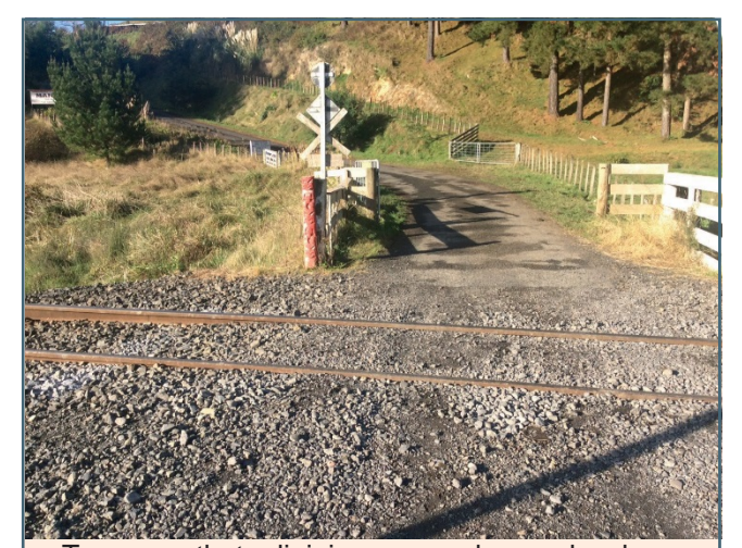
To ensure that adjoining owners have a level crossing that is best suited to their property type and usage KiwiRail now requires the use of 'timber panel', 'asphalt' or 'concrete slab' private level crossings surfaces which have lower maintenance requirements than gravel surfaces and help to prevent vehicles causing damage to the railway.

In many instances, private level crossings consist of 'Gravel surfaces' over a level crossing. These level crossings usually consist of 'AP40' aggregate. Gravel surface level crossings have high maintenance requirements and are generally not fit for purpose.