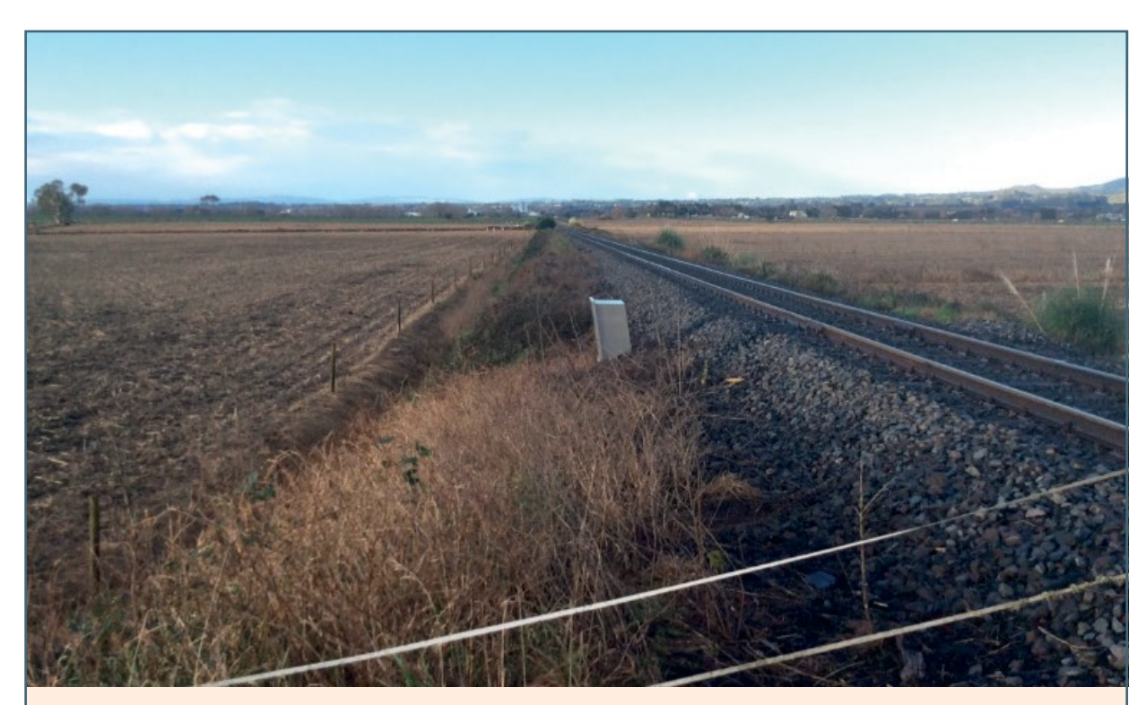
Unobstructed views up and down the rail corridor from 5 metres back from the railway track on either side of the level crossing

Approaches to the level crossing should slope away from the railway so surface water cannot run onto the railway lines