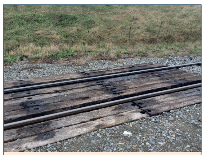
A 'TIMBER PANEL' LEVEL CROSSING consists of timber sleepers running parallel to the railway line. Timber panel level crossings require minimal maintenance and can last up to 20 years before needing to be reviewed. Timber panel level crossings are ideal for residential, lifestyle and rural properties.